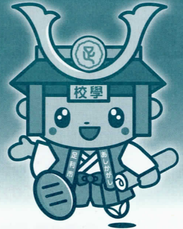
Ashikaga City image character "Takauji kun"

We hope many people will get to know this summit.